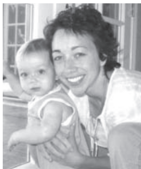
One year after surgery