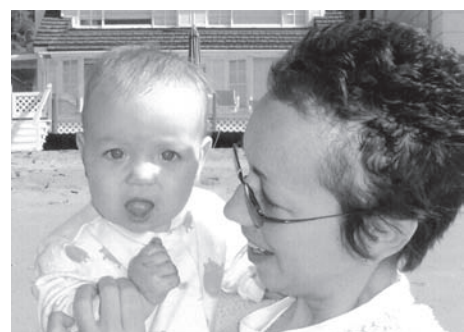
nine months after surgery