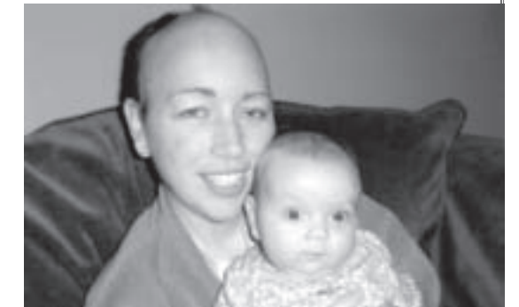
three months after surgery