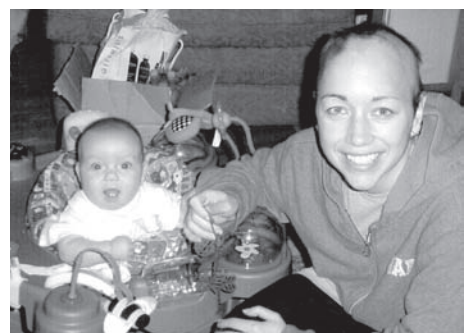
five months after surgery