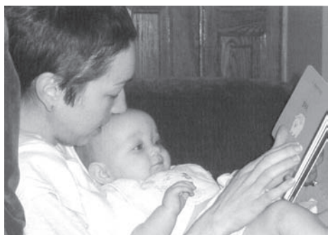
eight months after surgery